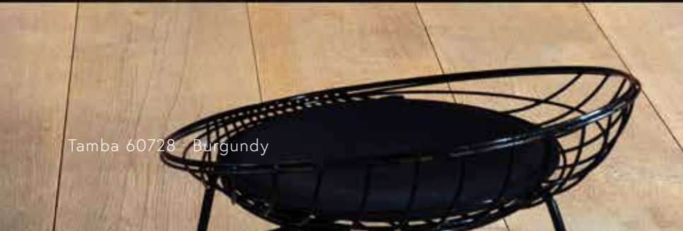
Tamba 60728 · Burgundy

Each design in the collection is inspired by the rich textures of different types of rope