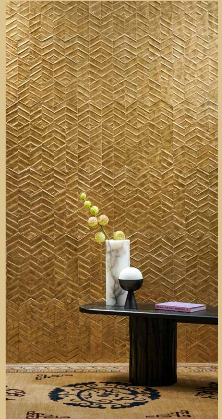
Lucea 70313 · Marigold

Capiz plays a starring role in four unique designs of our Luster collection. Each design, which is available as a tile, features a striking relief thanks to a creative technique: threads are glued onto the subsurface, after which water-soaked capiz is printed onto this pattern. Each design is available in two neutral and two bolder hues with a luxurious, natural pearlescent sheen.