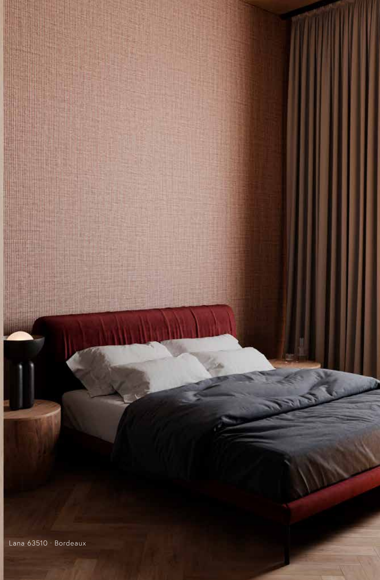
Lana 63510 · Bordeaux