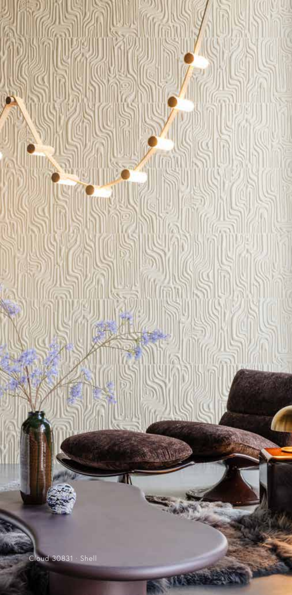
Cloud 30831 · Shell