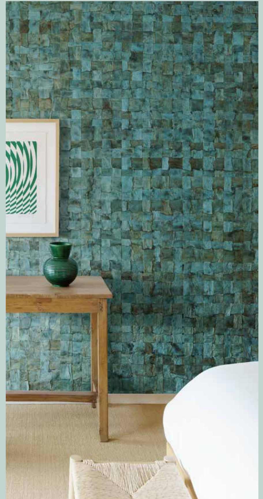
Alba 40704 · Turquoise

The bark of the mulberry tree and the fibres of the raffia palm are processed using artisanal techniques to create unique designs. These hand-crafted wallcoverings, whose textures and colours evoke the landscape of Melaky, have an unexpectedly organic look and feel. The warm, natural hues and textures combine beautifully, creating a sense of simplicity and depth. It is a timeless collection that is uniquely suited to both modern and traditional interiors.