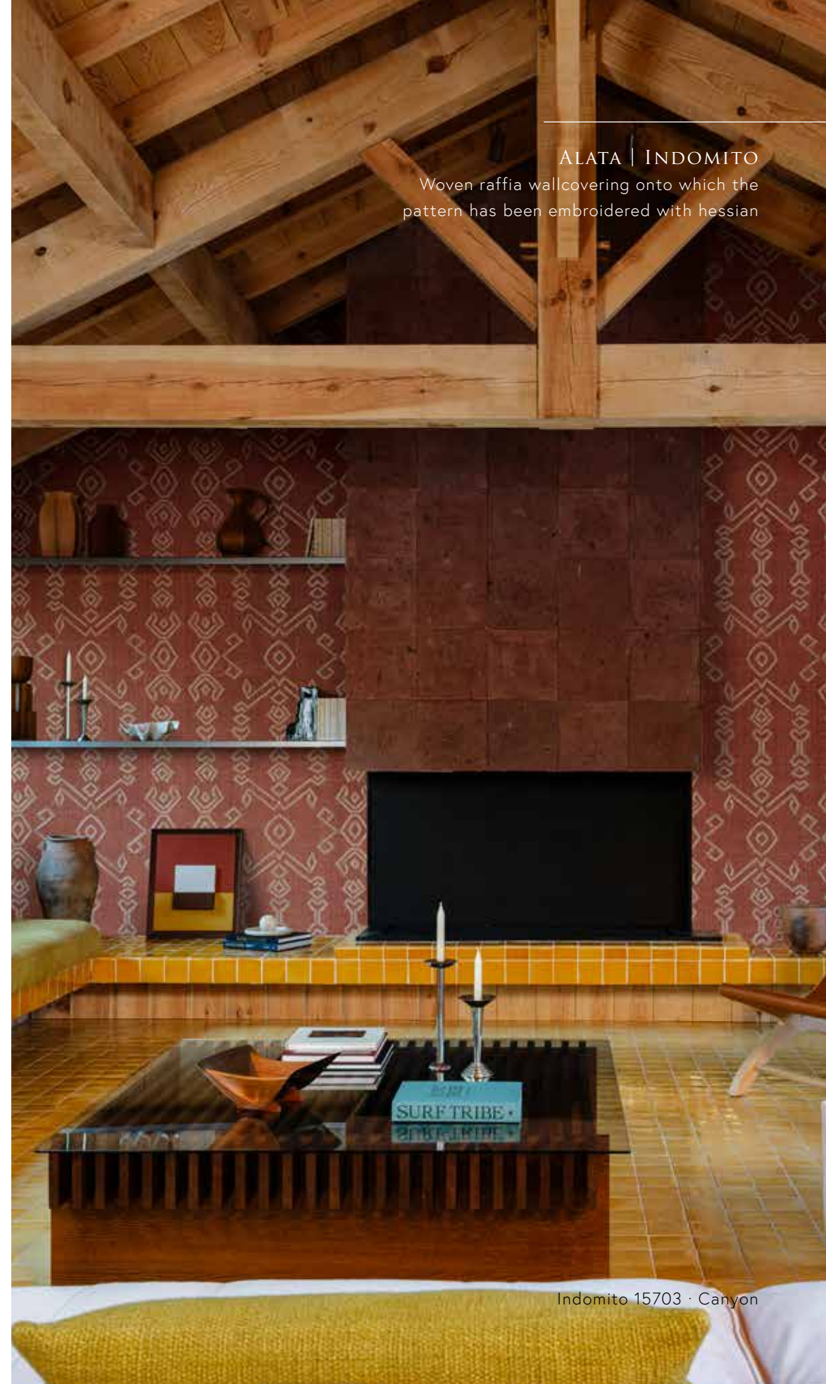
ALATA | INDOMITO

Woven raffia wallcovering onto which the pattern has been embroidered with hessian