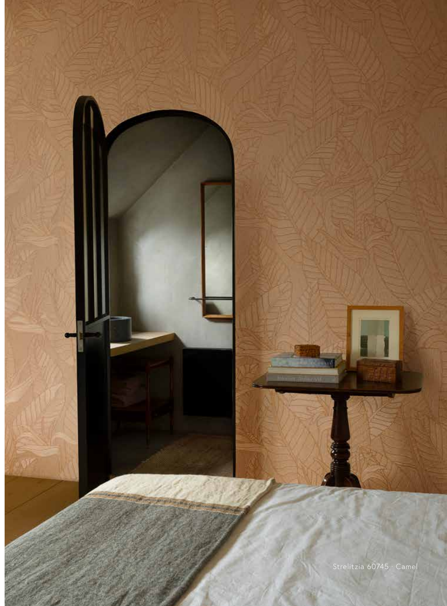
Strelitzia 60745 · Camel