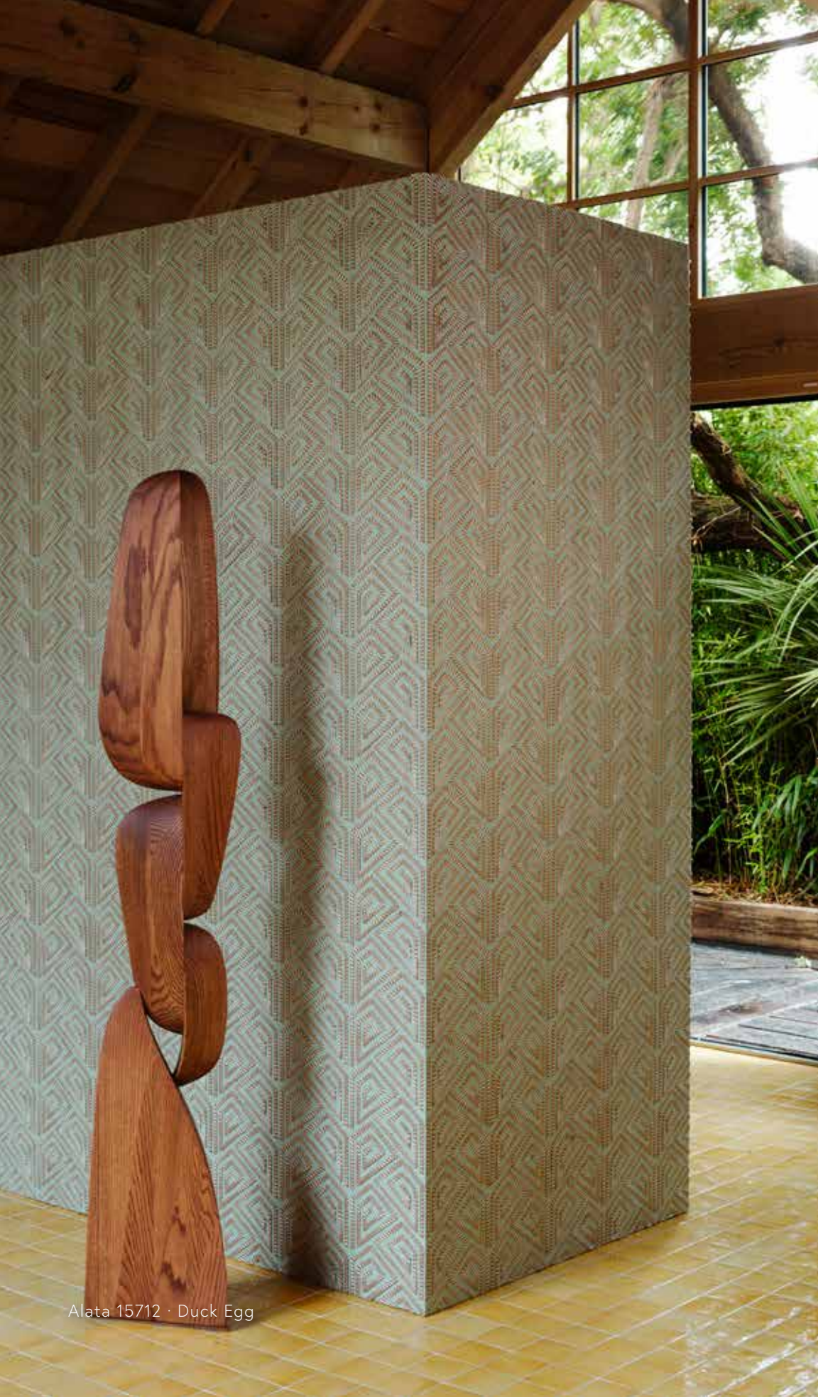
Alata 15712 · Duck Egg