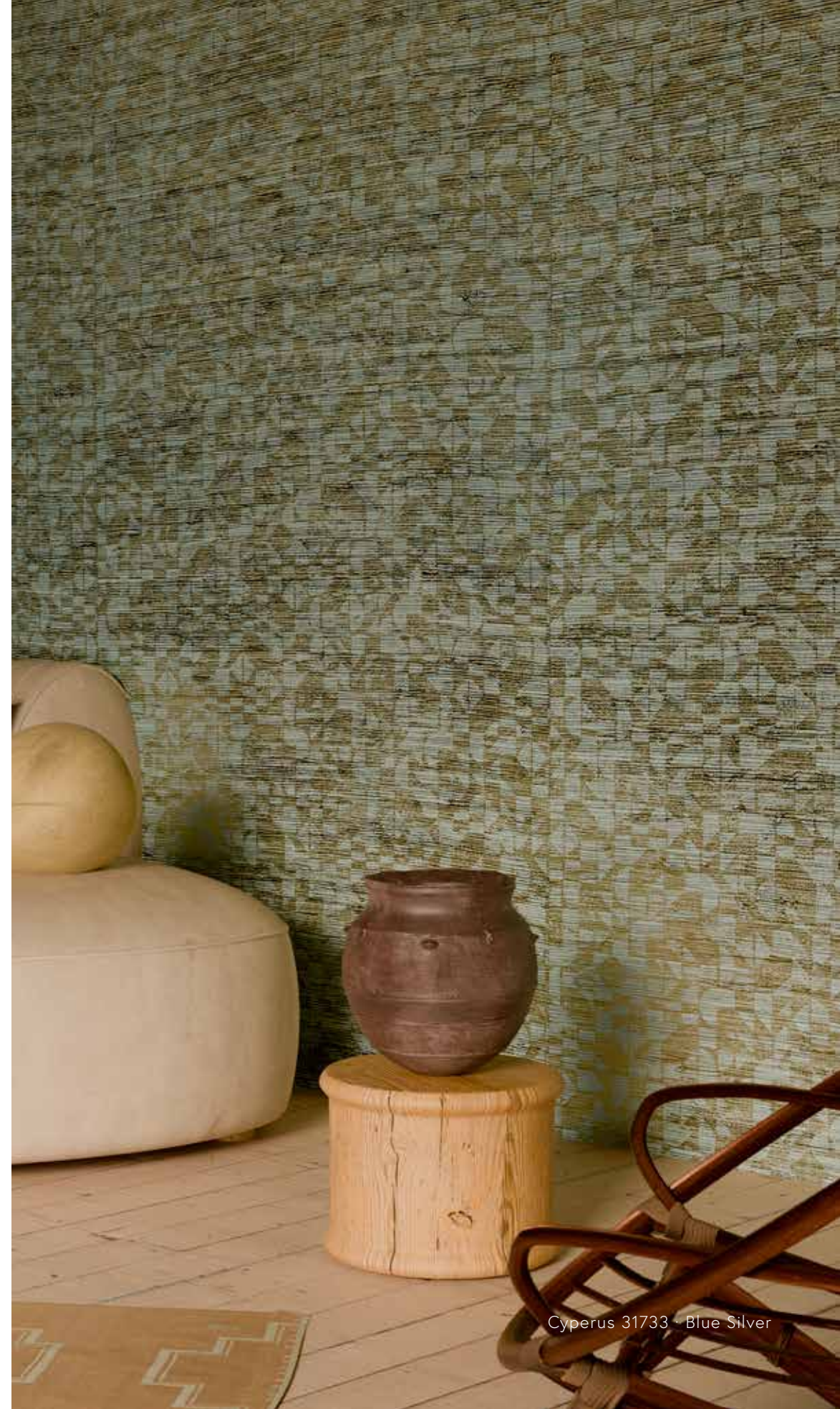
Cyperus 31733 · Blue Silver