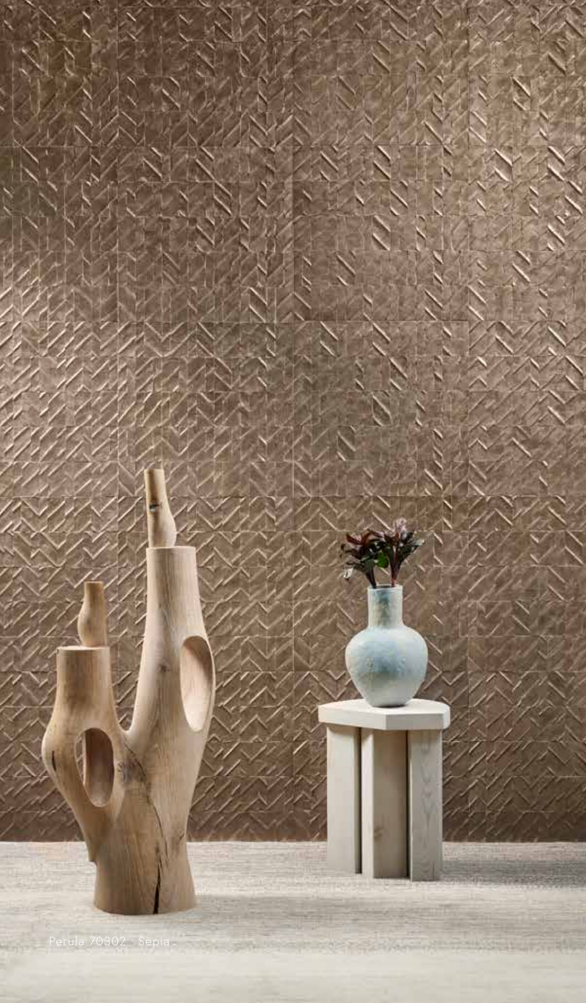
Perula 70302 - Sepia