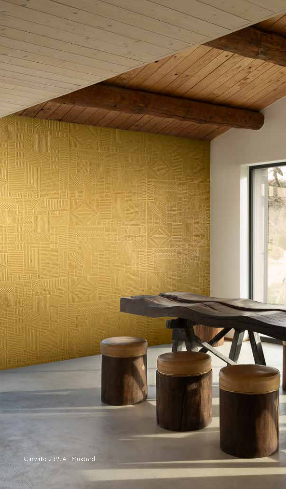
Carvato 23924 · Mustard