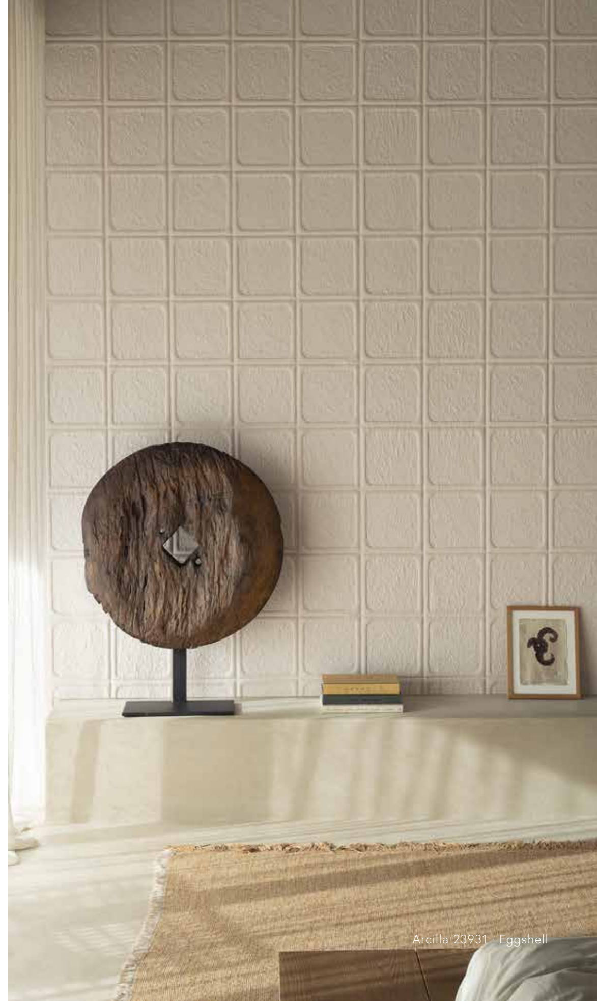
Arcilla 23931 · Eggshell