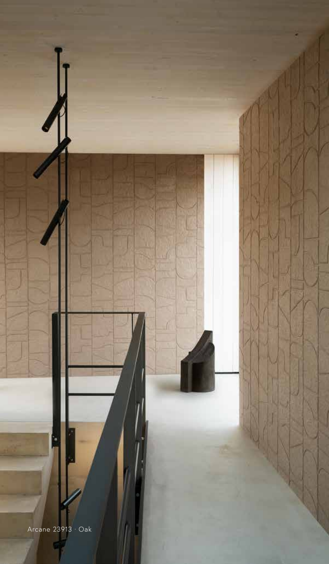
Arcane 23913 · Oak