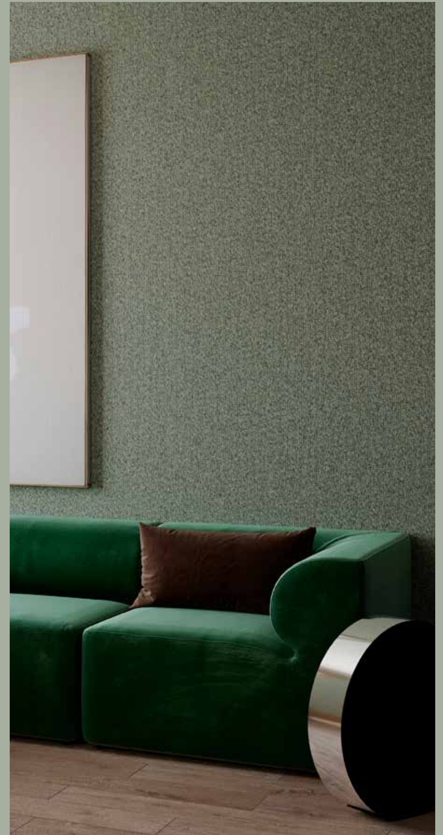
Montagna 63525 · Juniper

The three plain wallpapers in this collection are all interpretations of quality woven wool. Their natural colours provide the ideal canvas for a warm and vibrant interior, combining seamlessly with 'harder' materials such as glass, metal and concrete. Each plain wallpaper comes in a wide range of natural colours.