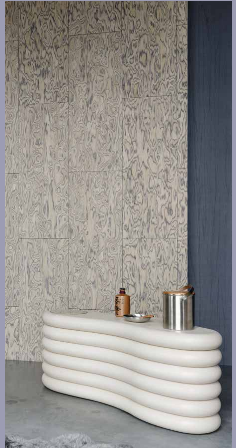
Coti 30801 · Shadow

Arte has a long tradition of designing and manufacturing wallcoverings using the most unusual materials and innovative techniques. Combining bold patterns with a range of exceptional materials and cutting-edge techniques, this collection is nothing short of emblematic. Wood veneers, 3D textiles, and a high-gloss finish: each wallcovering in this collection will elevate your interior.