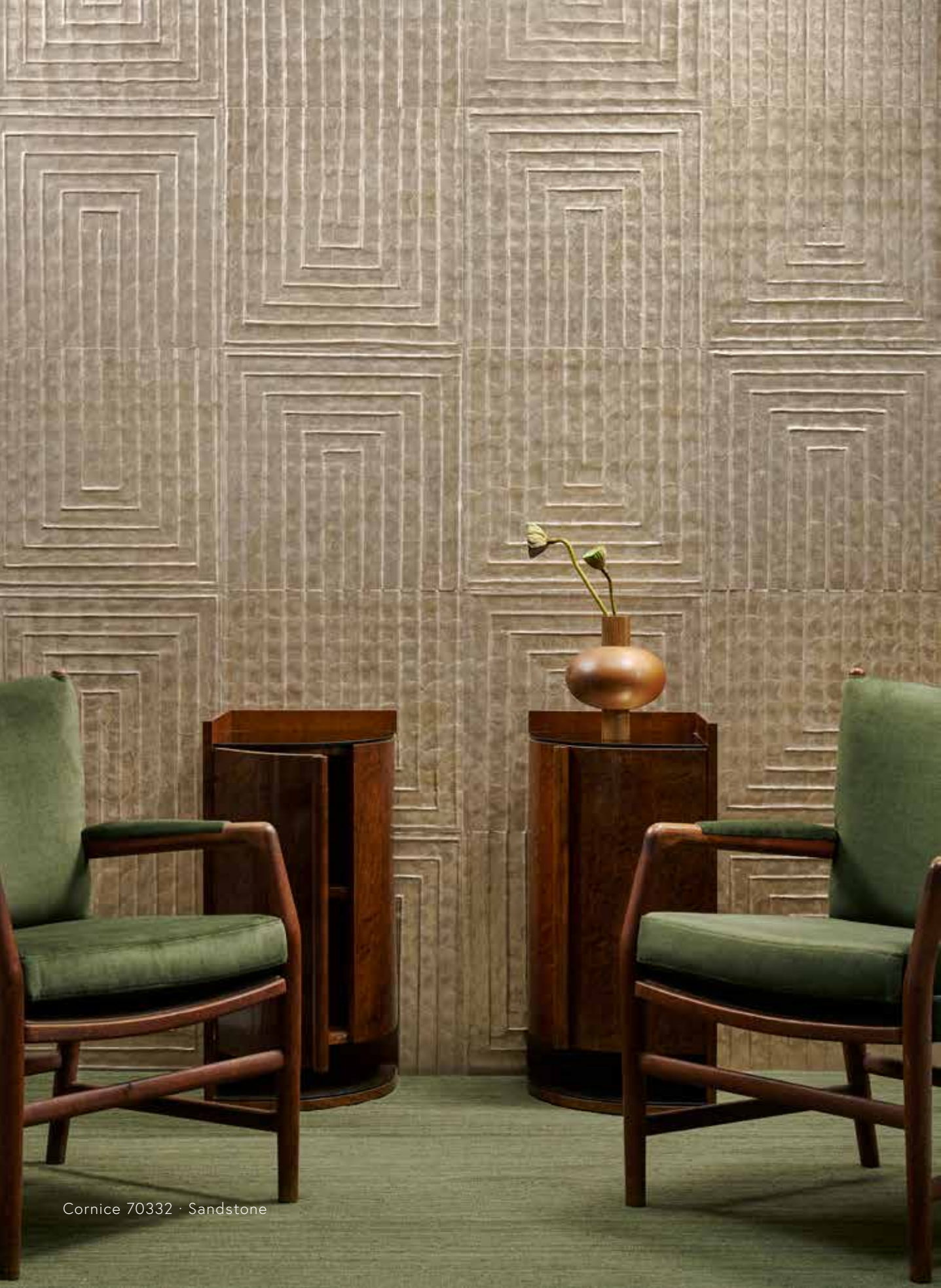
Cornice 70332 · Sandstone