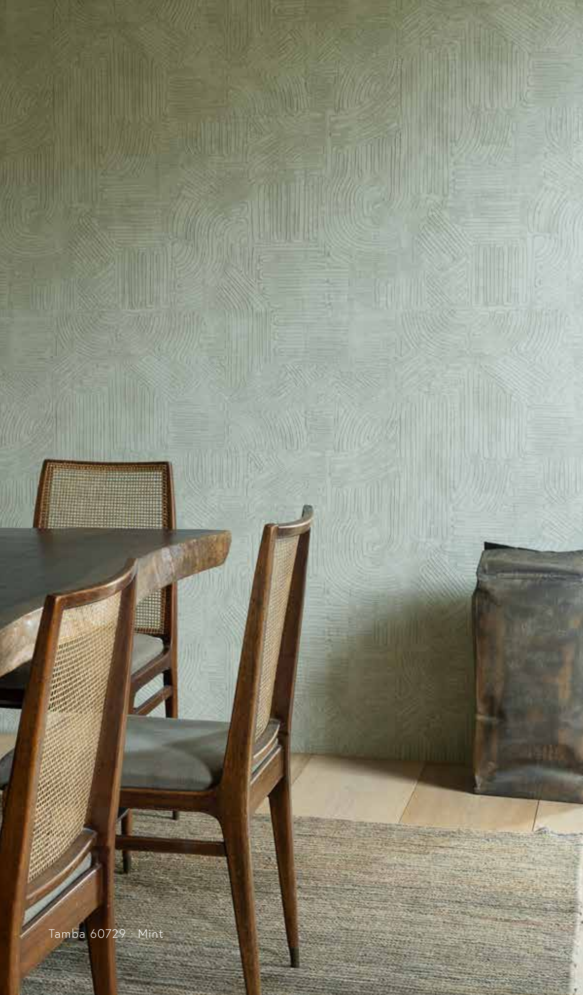
Tamba 60729 · Mint