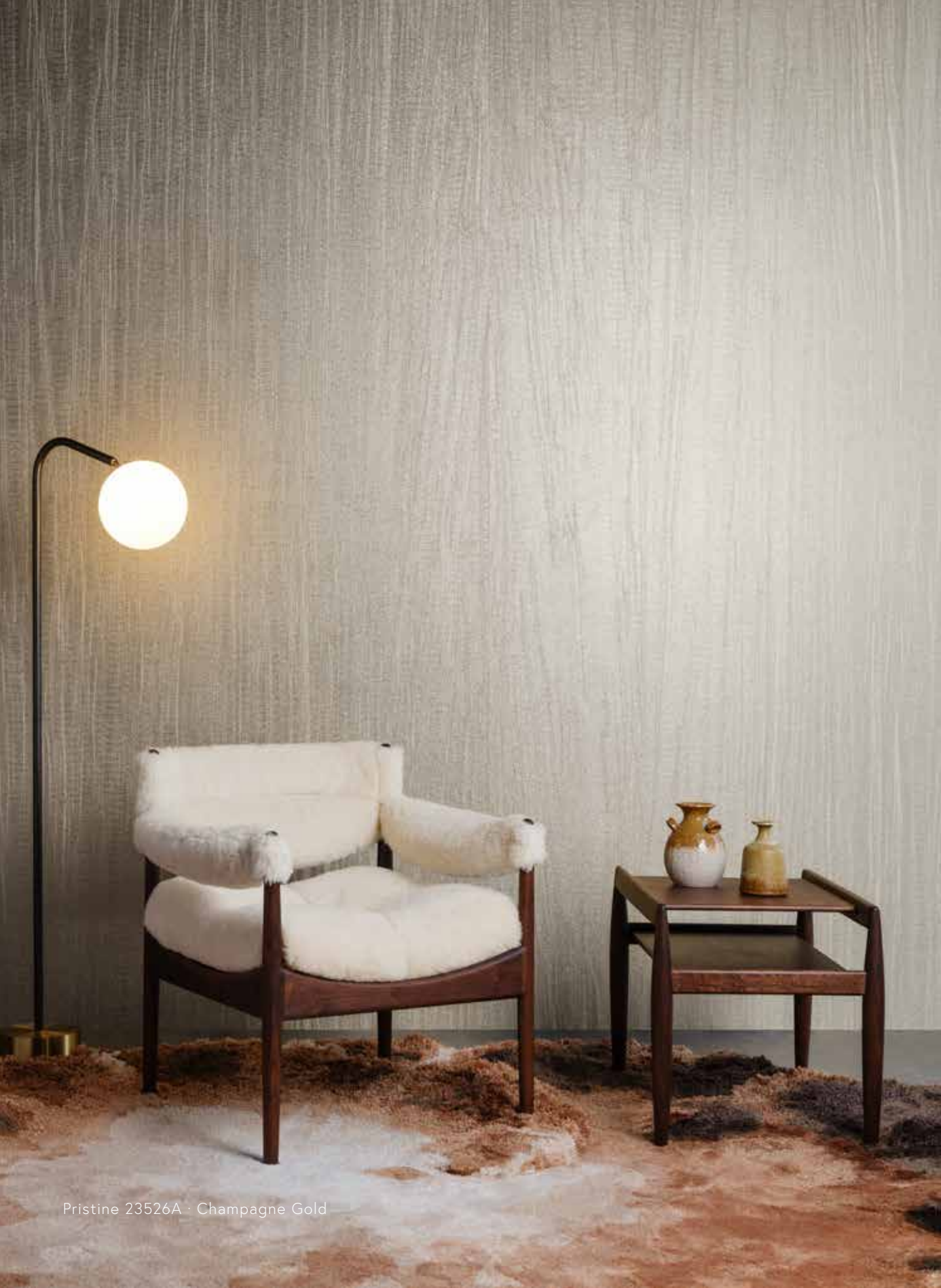
Pristine 23526A · Champagne Gold