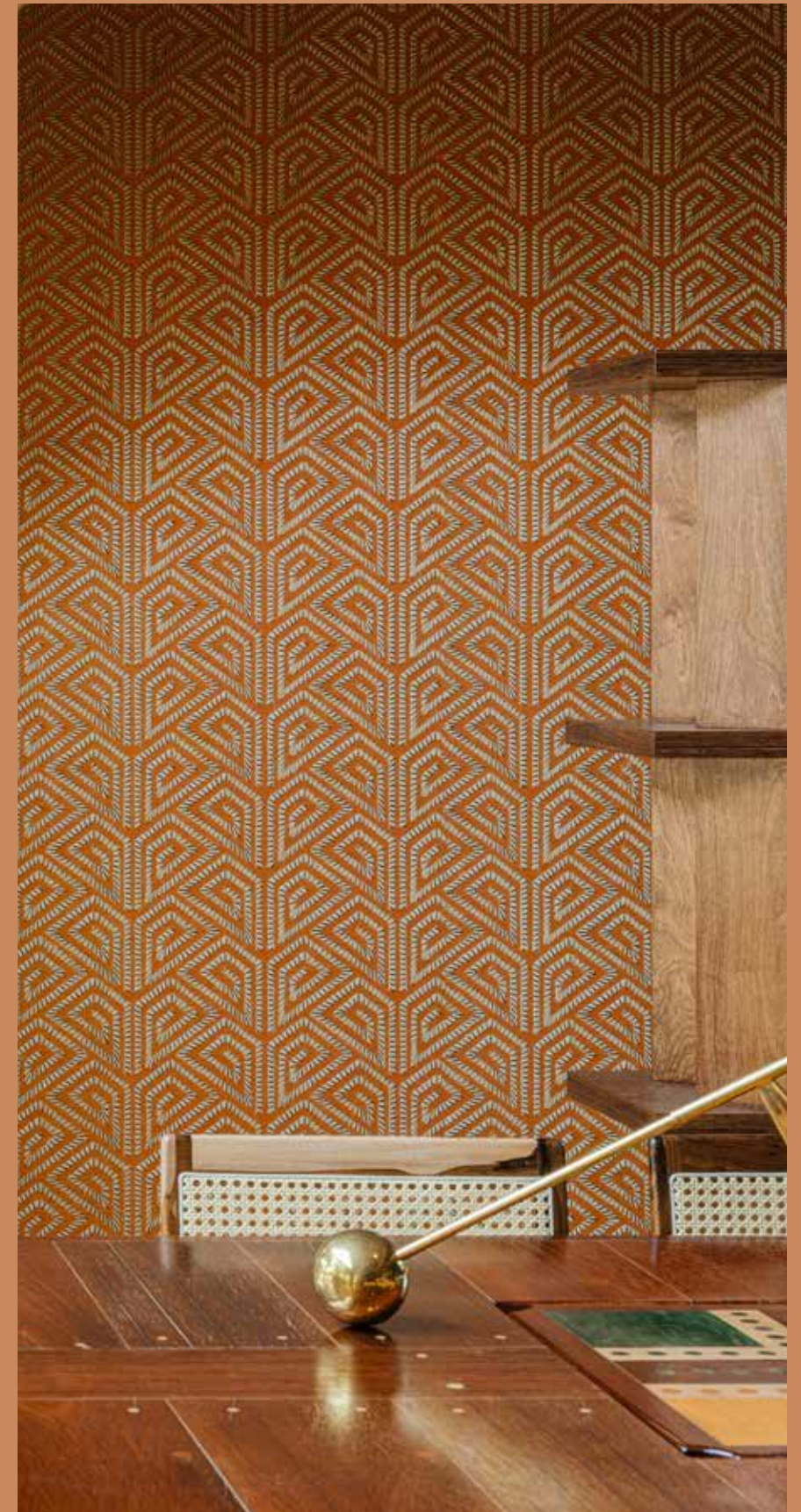
Alata 15711 · Orange

This story of courage and hubris, but also of unique creativity and of pushing boundaries to craft something almost impossible, provided the inspiration for this collection. Blending unique, creative designs with technical innovation, Icarus uses materials that have never been incorporated into wallcoverings in this way before. The innovative designs of the Icarus collection celebrate craftsmanship and redefine the boundaries of what is possible.