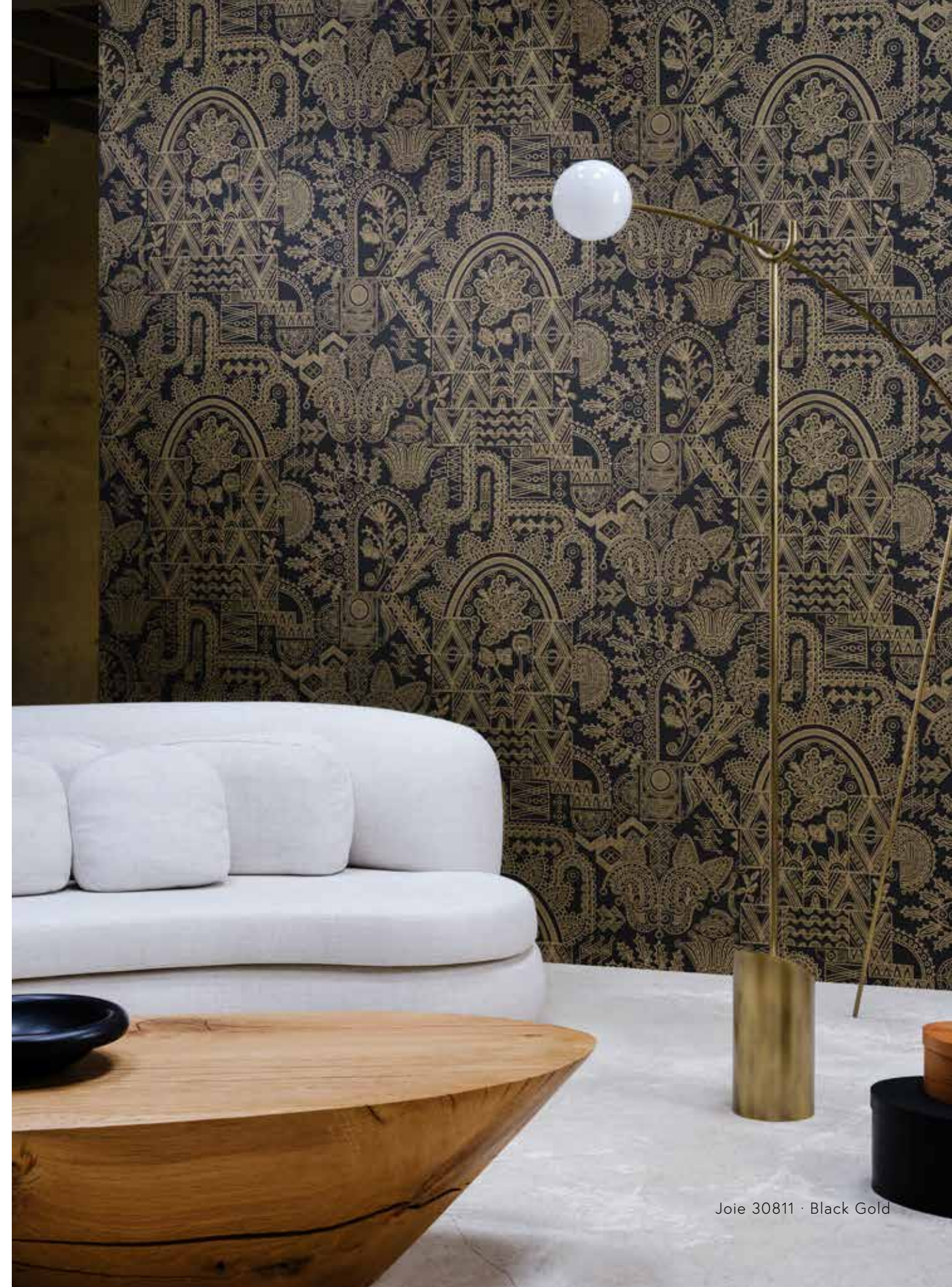
Joie 30811 · Black Gold

Dreamy 3D textile wallcovering with intriguing shapes and patterns