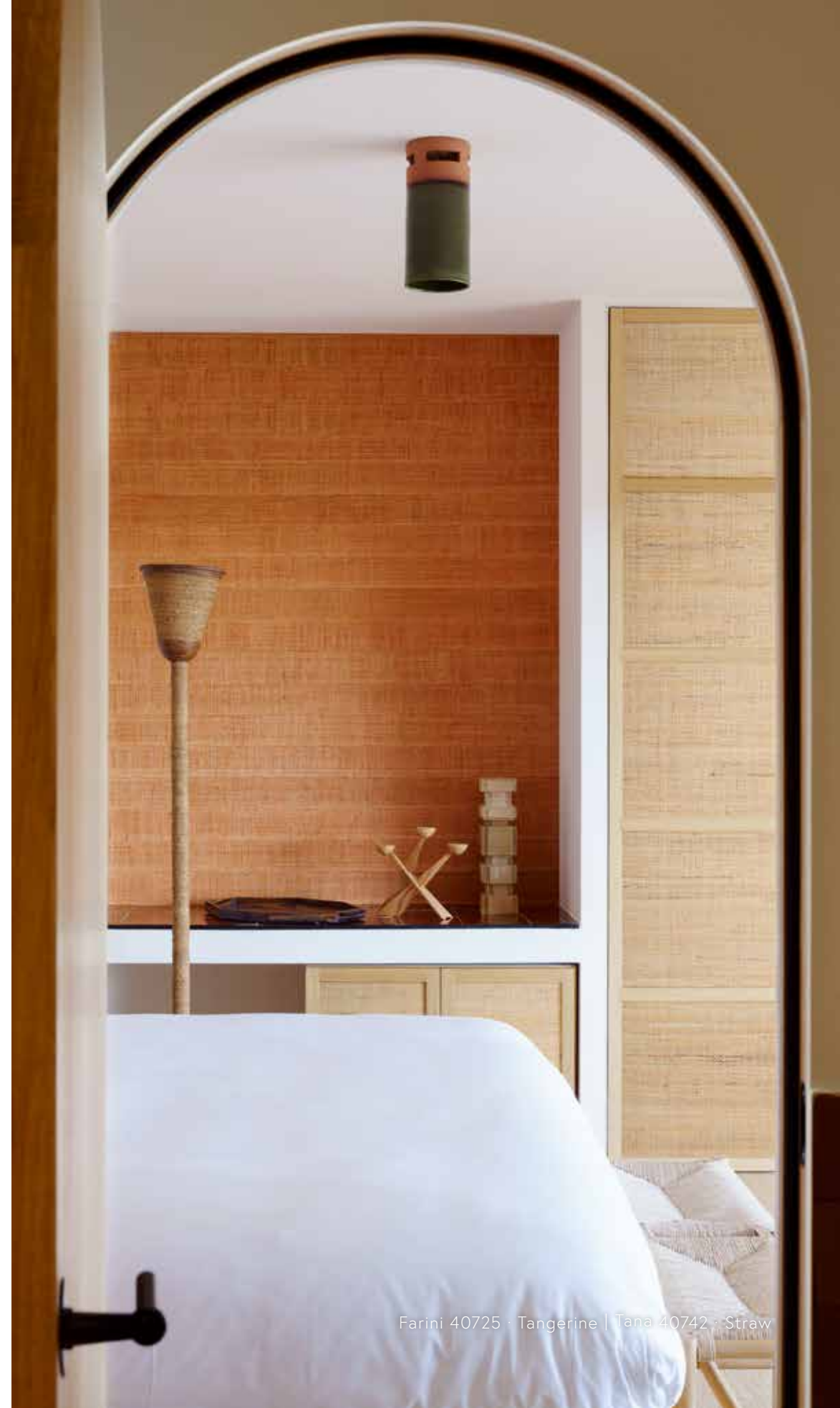
Farini 40725 · Tangerine | Tana 40742 · Straw