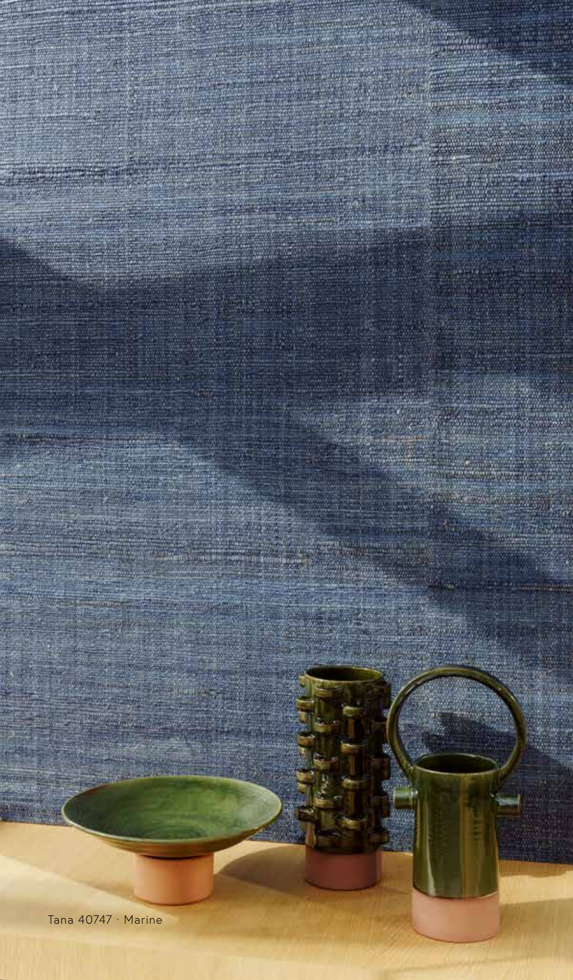
Tana 40747 · Marine