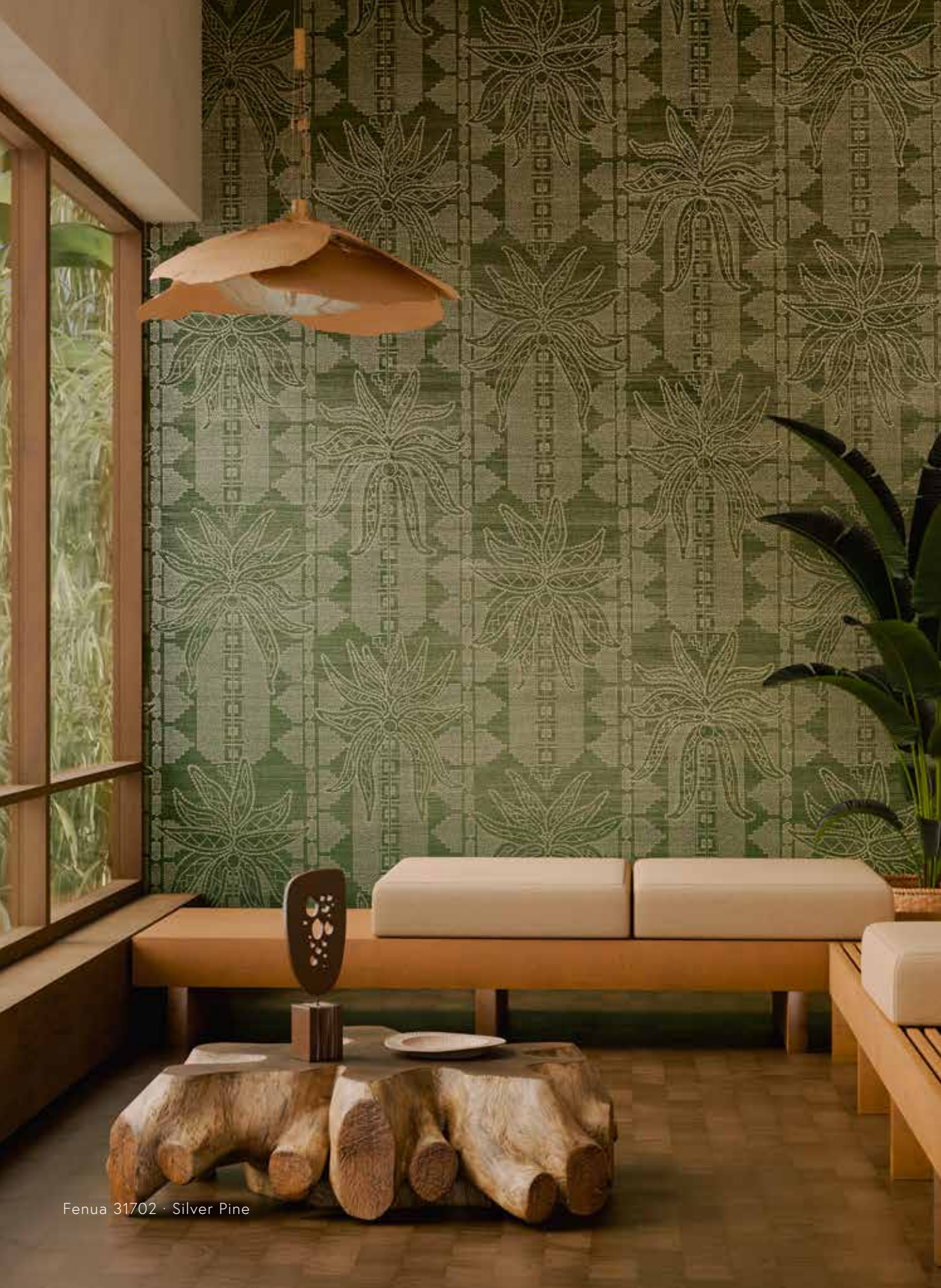
Fenua 31702 · Silver Pine