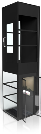
ARITCO LIFT 2024 DEC - English

Aritco HomeLift Access comes with many customization options. You can personalize your lift by choosing from more than 200 different colors, two different glass types and eight different floorings. The lift is very practical and smart and increases your home's accessibility for everyone. It comes in several different sizes. The larger models accomodate a stroller or wheelchair. The lift is SmartLift enabled which means you also get live status information in the app and the maintenance provider can get access to a Fleet management system for remote monitoring and support of the lift. The lift is equipped with our SmartSafety system, with safety features that anticipate situations and prevent accidents.